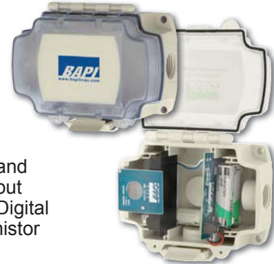
Wireless Universal Input Transmitter with the BAPI-Box open and closed

All models transmit their data every 10 to 17 seconds at 418 MHz to a BAPI 418 MHz Receiver. An Output Module connected to the Receiver converts the data back to its original form for the BAS controller. The transmitters are battery powered and only require wiring from the remote input sensor.